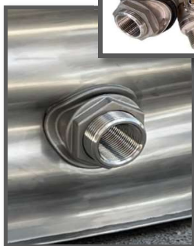
Stainless Steel version

A 25mm OUTLET is fitted at the base of the tank, as shown in the images for the Stainless Steel and Aquaplate tanks. The BALL VALVE is supplied for installation after delivery. You can also include a 50mm outlet and ball valve installed another corrugation above. This allows for efficient water balancing when interconnecting tanks. The 50mm outlet also protects the pumps and internal water appliances as it draws the water from above the sludge / anaerobic level.