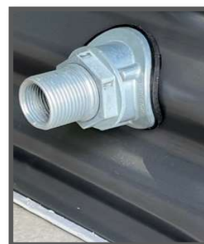
Aquaplate / Colorbond Version

A 25mm OUTLET is fitted at the base of the tank, as shown in the images for the Stainless Steel and Aquaplate tanks. The BALL VALVE is supplied for installation after delivery. You can also include a 50mm outlet and ball valve installed another corrugation above. This allows for efficient water balancing when interconnecting tanks. The 50mm outlet also protects the pumps and internal water appliances as it draws the water from above the sludge / anaerobic level.